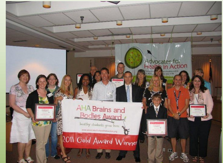
Raleigh Award Winners